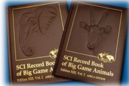
Record book Volume XIII Free with Package #2- & #5